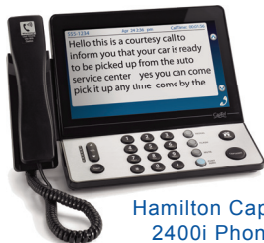
Hamilton CapTel 2400i Phone

Expand your options for receiving captions of your telephone calls through Hamilton CapTel: