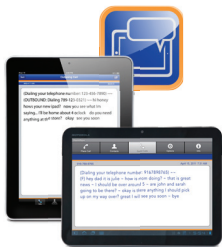
Hamilton CapTel App for Tablets