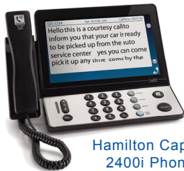
Hamilton CapTel 2400i Phone

Expand your options for receiving captions of your telephone calls through Hamilton CapTel: