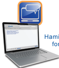
Hamilton CapTel for PC/Mac