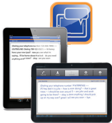
Hamilton CapTel App for Tablets